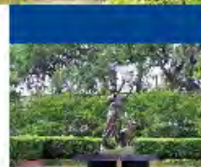
Savannah - the "Belle of Georgia"