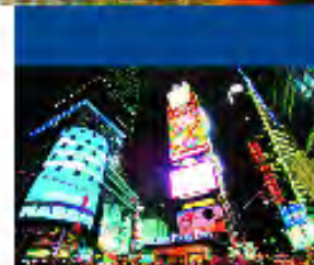
Journey to electrifying Times Square