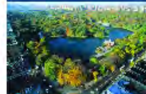
Visit famous Central Park

Diamond Tours Inc. Bringing Group Travel to a Higher Standard®