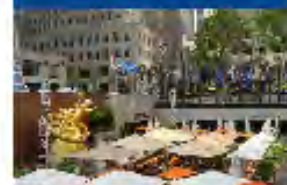
Explore amazing Rockefeller Center