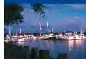
Beaufort, SC - "Queen of the Carolina Sea Islands"