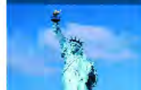
The Statue of Liberty