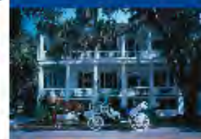
You'll feel like you've traveled back in time!