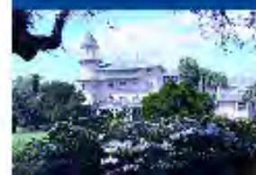
Jekyll Island - Georgia's elite coastal barrier island