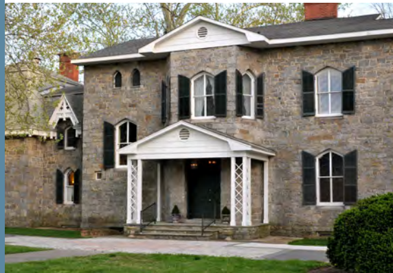
Magnolia Manor (Manor House)